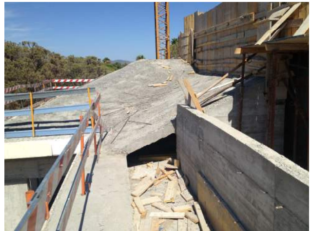
Concrete walls (roof terrace)