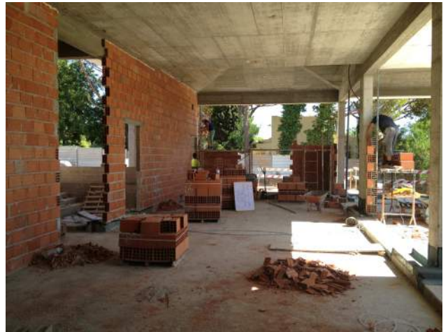
Brick laying (Ground floor walls)