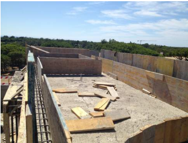
Formwork to support the concrete beams (roof)