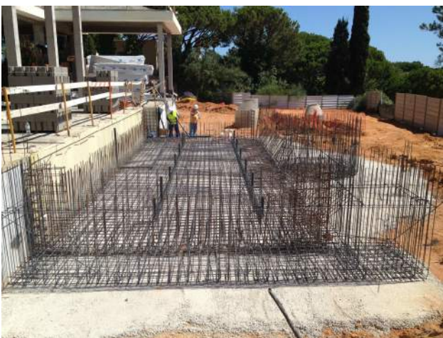
Steel moulding (pool and jacuzzi)