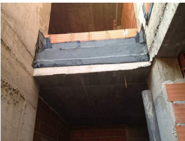
Waterproofing membrane (with schist)