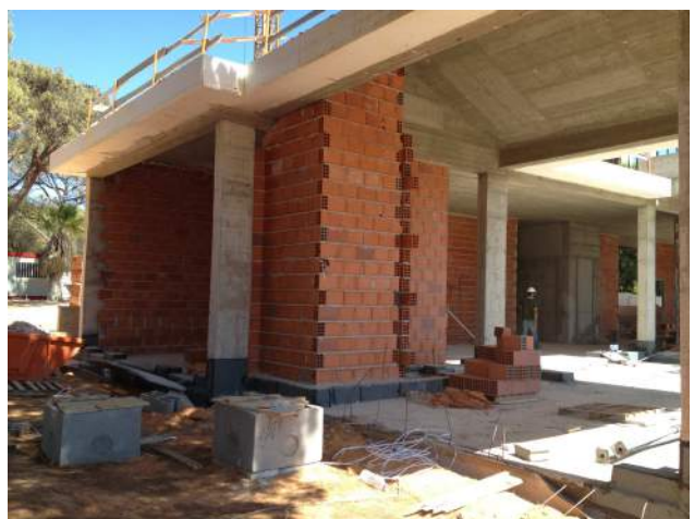
Brick laying (Ground floor walls)