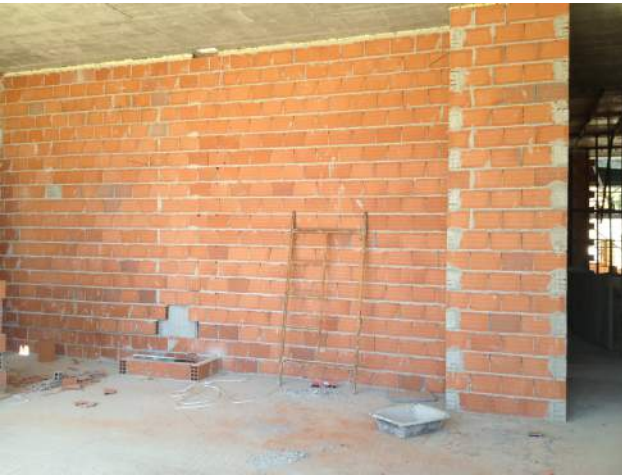
Brick laying (ground floor walls)