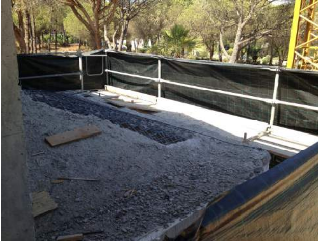
Concrete demolishing (Entrance "Porch/terrace")