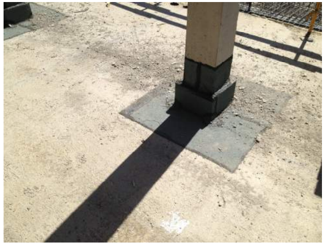
Waterproofing membrane (with schist)