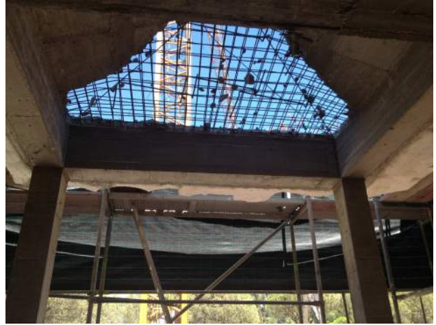
Concrete demolishing (Entrance "Porch/terrace")