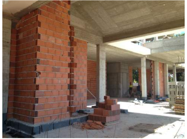
Brick laying (Ground floor walls)