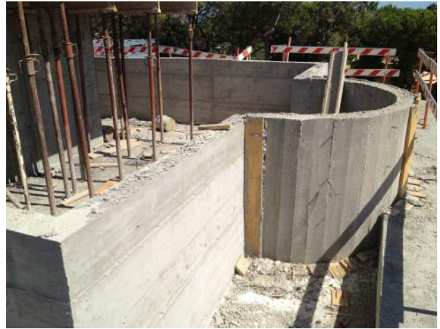
Concrete walls (roof terrace)