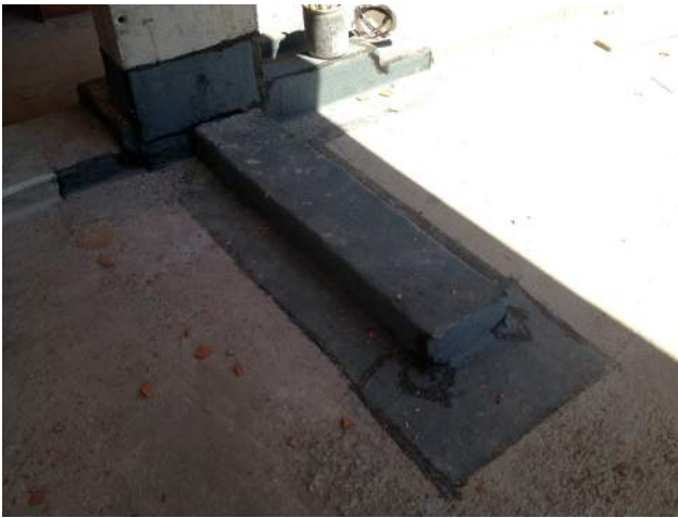
Waterproofing membrane (with schist)