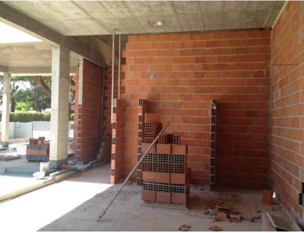
Brick laying (Ground floor walls)