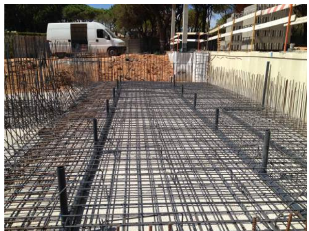
Piping for filtering and cleaning (Pool)