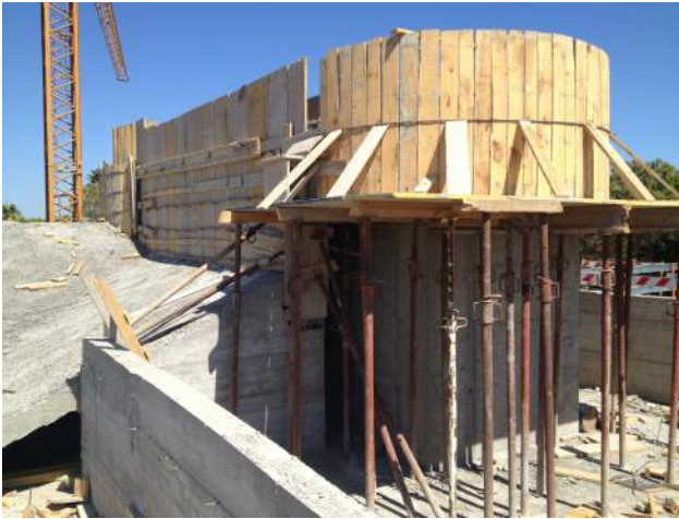
Formwork to support the concrete beams (Roof)